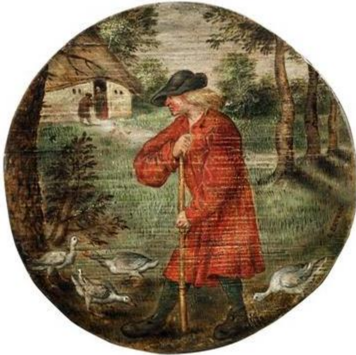
Gänsehirte, by Pieter Brueghel the Younger, a Flemish painter known for his depictions of peasant life in rural settings